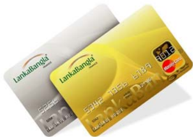
LankaBangla Card... says more about you than money could ever!

For further queries, please contact our Customer Services/Call Centre 9862696, 9888247, 0189243171 or 724547-8(Chittagong) e-mail:cards@lankabangla.com